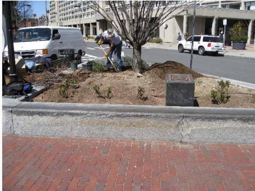
Park Before Planting